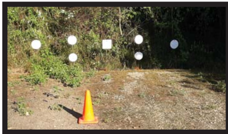
Steel Plates Shooting, Rimfire Challenge & 3-Gun

North Bristol Sportsman's Club 7229 N. Greenway Road Sun Prairie, WI 53590 608-837-6048 northbristolsportsmansclub.com