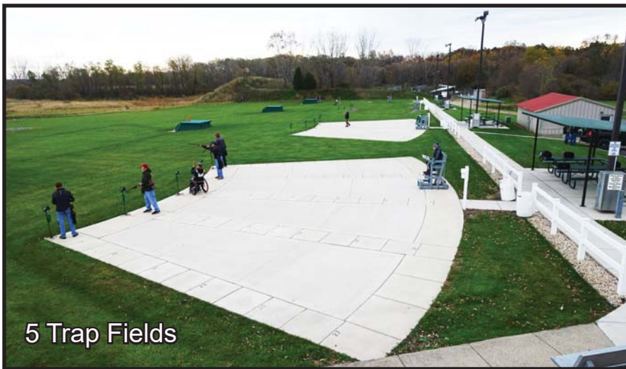
5 Trap Fields