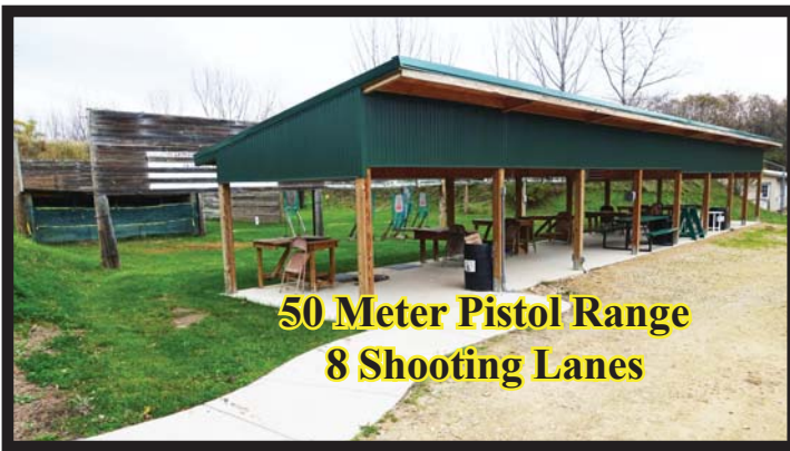
50 Meter Pistol Range 8 Shooting Lanes

Membership Applications Available at the club house and on line at: northbristolsportsmansclub.com